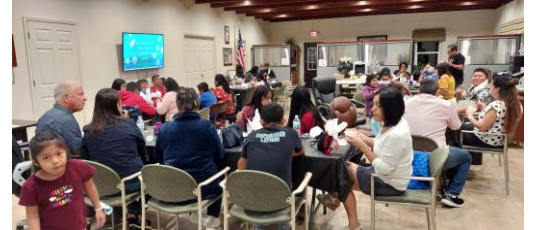
2021: Awards Night Celebration