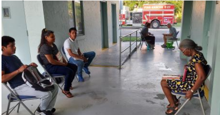
2022: Classes outside due to room unavailability