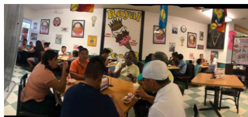
2018: Royal Scoop Treat