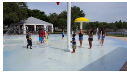
2017: Vineyards Community Park visit