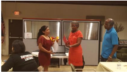
2018: Student of the year