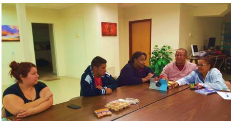
2016: 1st class at the Café of Life