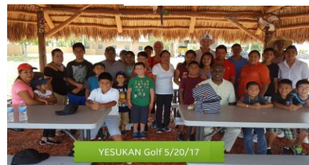
2017: Outing to Golf Safari