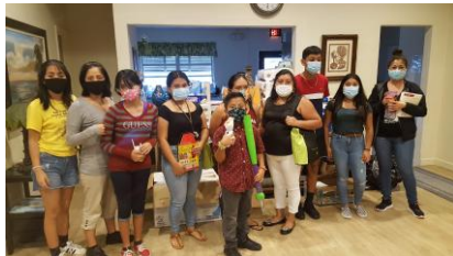
2020: Summer Fun event