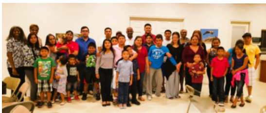
2016: 1st Awards Night Celebration