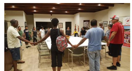
2018: Time to Pray