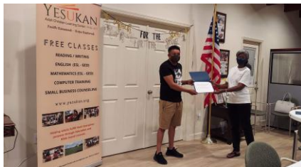
2020: Celebrating Successes