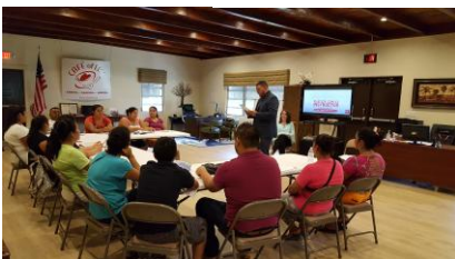
2017: 1st Financial Literacy