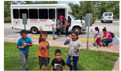
2021: COL Transport for class