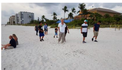
2018: Trip to the Beach