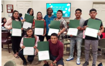
2021: Awards Recipients