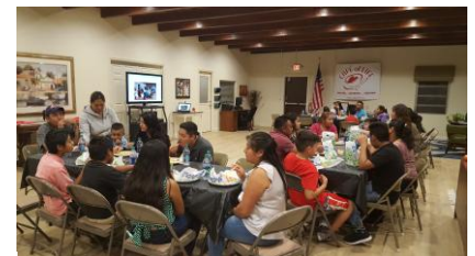
2017: 2nd Awards Night