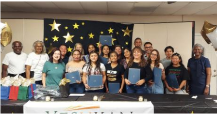
2023: Awards Night certificates recipients