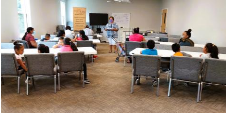
2021: ESL at Anchor Christian Church